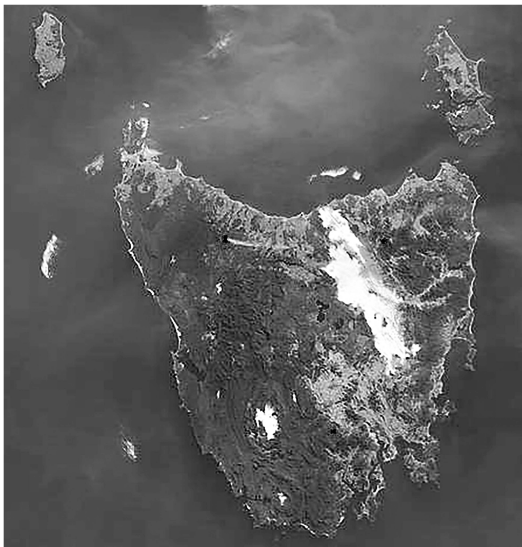
Figure 1 A temperature inversion causing cold air drainage to accumulate as fog in the low-lying areas of the Tamar Valley and Midlands (Source: National Aeronautics and Space Administration (NASA) Earth Observatory Image, 2002).

period. The latter provided, in effect, a control for changes in disease prevalence and management over the study period unrelated to PM_{10} knowing that Hobart, in Southern Tasmania, has spatially more heterogeneous and rather lower average particle pollution in winter. Hobart is approximately 200 km from Launceston, and shares many similarities in population and weather characteristics.