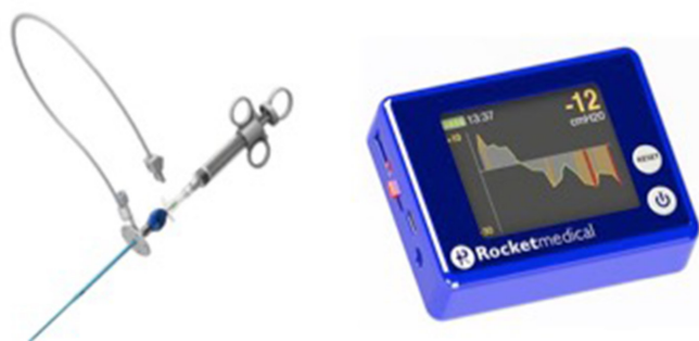
Figure 1 Rocket Medical (UK) digital pleural manometer and re-usable display unit.

Current guidelines direct clinicians to offer a choice between TP or IPC based on patient preference, given the equivalent efficacy of these approaches in two randomised controlled trials. 3 However, this apparent equivalence cannot be generalised to patients with NEL, since the incidence of NEL was extremely low in these important studies, occurring in only 3/54 (6%) and 2/72 (3%) patients in TIME-2 and AMPLE, respectively. 4,5 In clinical practice, the incidence of NEL is almost certainly higher; in audit data recently reported by our unit, NEL was identified in 15/65 patients with MPE (23%) who underwent complete pleural fluid drainage. 6 In this series, NEL was also associated with a twofold to fourfold increase in all-cause mortality, which may explain the under-representation of NEL in the TIME-2 and AMPLE studies. 6