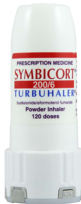
Figure 2 SmartTurbo monitor attached to Symbicort turbuhaler.

(n=3), 200/6 µg per actuation (n=12) and 400/12 µg/actuation (n=5)). Half of the turbuhalers had previous use, with counter displays showing that over half the number of available doses had been administered. The date and number of each actuation were recorded in the diary. The time of each of the low-use actuations was recorded. The first and last of the eight high-use actuations had their times recorded, as well as the number of actuations that occurred between them (at a maximum of 20 s apart). The time was taken from the clock on the computer used for data upload from the monitors. This method was utilised to minimise the chance of investigator error affecting the interpretation of electronic actuation data. When a turbuhaler was inserted into or removed from a monitor, this was also recorded.